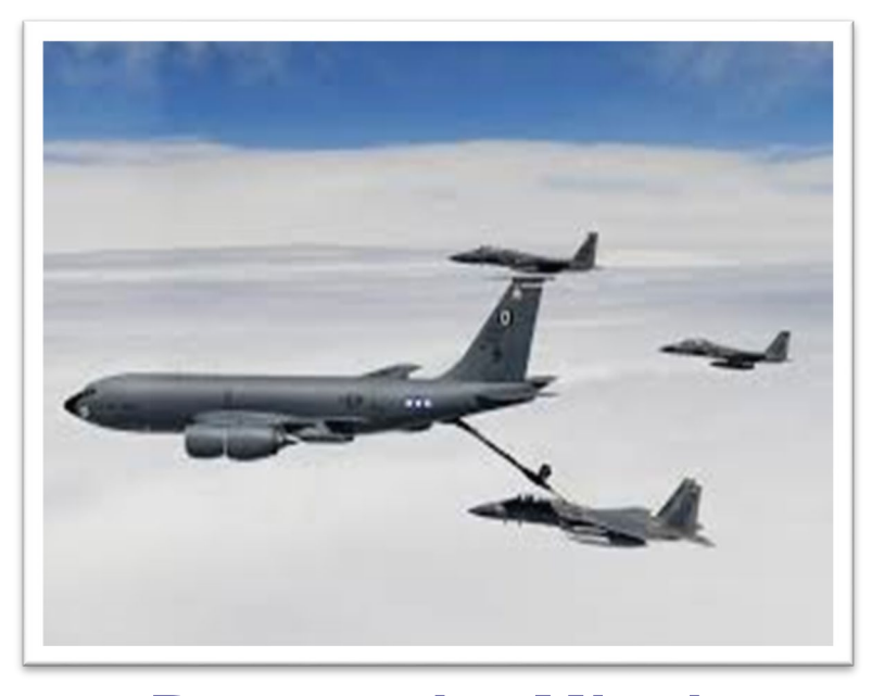
Protect the Mission

Digitally Adept Airmen Protect Personal And Mission Information From Adversaries.